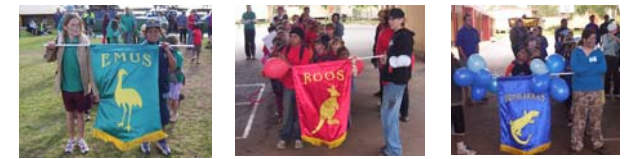
Eastern Emus Raeside Roos Breakaway Bungarras