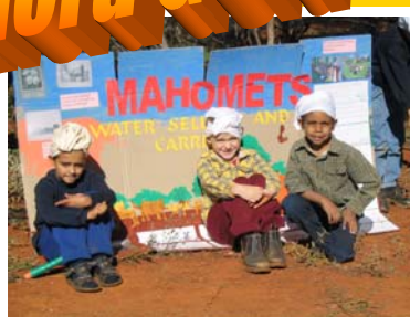
Pioneers Day - Gwalia