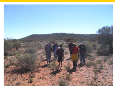
Survivor Leonora – 2 day camp Car rally, cycling, walking yrs 6-11