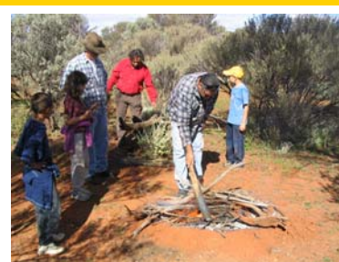
Aboriginal Bush Day