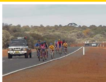
Leonora challenge 106 km Years 5 - 11